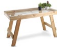
Cedar Bench Wiretop

25 1/2" x 48" $85.00 33 1/2" x 48" $95.00